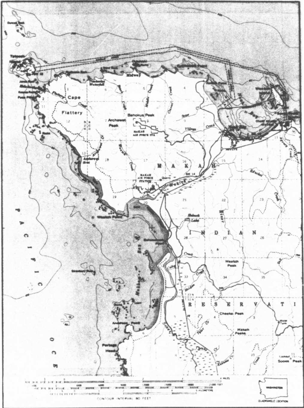
FIG. 2. Topographic map of the Cape Flattery region (U.S. Geological Survey Cape Flattery Quadrangle, 15-min series).

have been told of their existence by so many different Indians who professed to have seen them, that I think the story probably correct. The Indians do not think they got there by means of the flood, but that, as before stated, they are the remains of the feasts of the T'hlukloots, or thunder bird, who carried the whales there in his claws, and devoured them